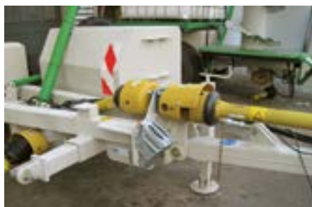
Down-hitch for deep pull for Hitch with Piton or K80.