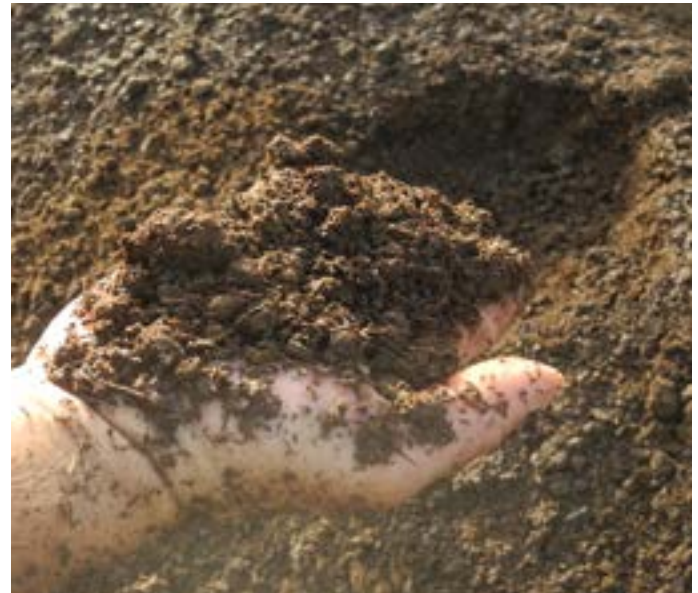
Horse manure after 5 weeks.

With the TG 301 a successful composting is achieved easily and quickly. This is due largely to the turning axis that works perfectly and that moves the material from the inside to the outside.