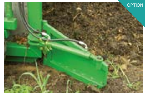
Hydraulic feeding plate, right side