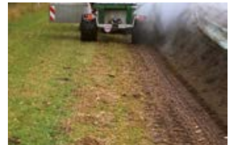
Thanks to the swivel weight it is also possible to move through the field. It also ensures optimum weight distribution and reduces the overall weight by approx. 1'500kg.