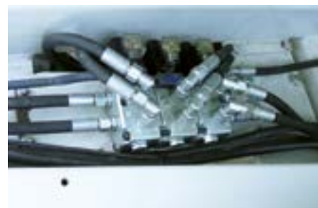
Electrohydraulic valve bank with control panel; (Single, double or triple)