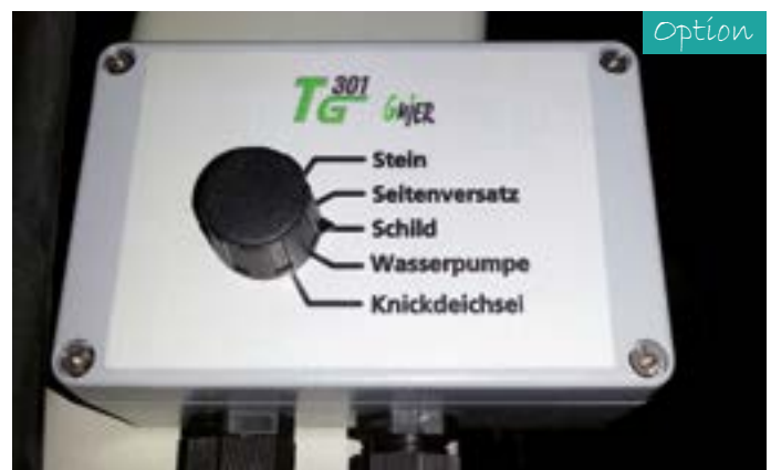
Easily manageable control panel. Switching via solenoid valves.