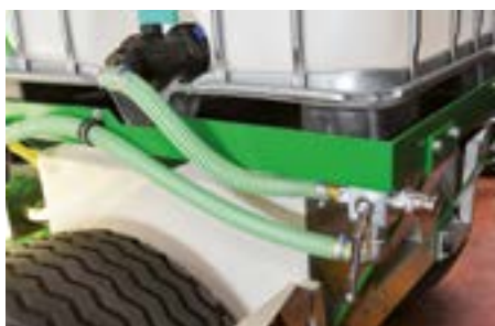
External water intake possibility for external water sources