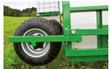
For transportation, the support wheel can be pivoted away, disassembly is not necessary.