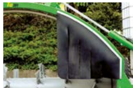
Splash guards (Serie)