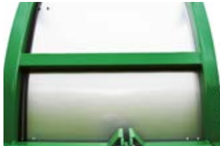
All wear plates are made of chromed steel.