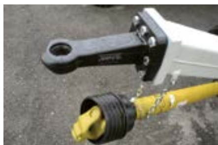
Standard trailer hitch front: DIN coupling