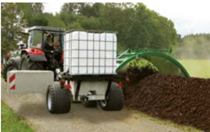
Rotating counterweight protects rural roads and agricultural tracks.