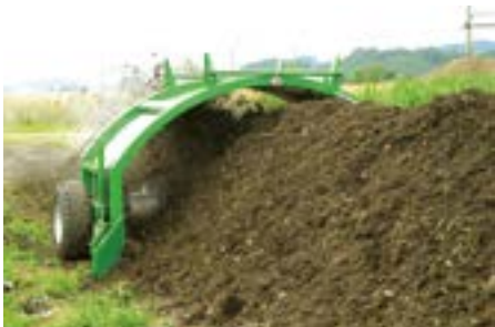
Maximum dimensions of the battery: 3 x 1.5 m, so that it can be composted aerobically.