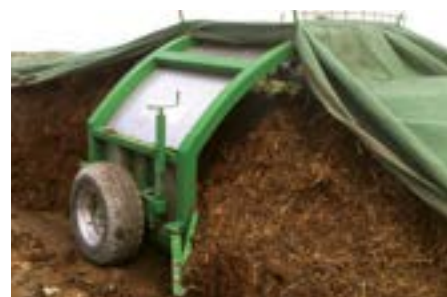
The fabric cover is joined to a smaller width to allow gases to escape. The hard manual work involving the wet fabric is avoided.