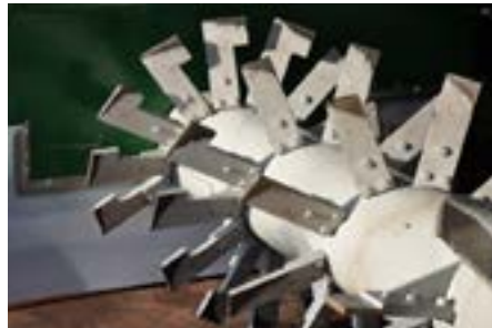
The good turning shaft turns the material from the inside to the outside, so that the microorganisms can be replicated everywhere optimally.