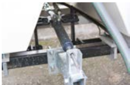
Hydraulic trailer brake