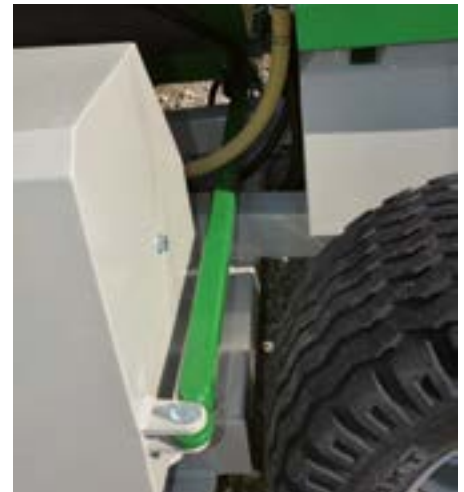
Automatic lateral weight (Serie)

The purchaser is responsible for the country-specific operating permit. Please talk to our advisors.