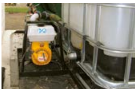
Turners are designed in such a way that their own water pumps can also be installed.