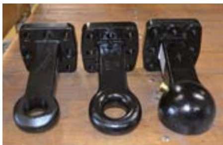
DIN (Serie) Piton K80