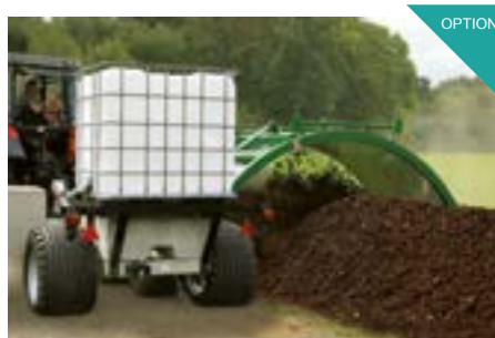
Complete irrigation system