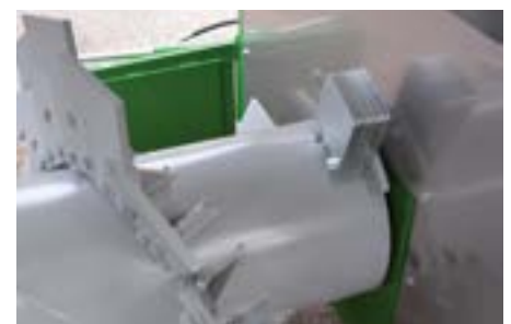
12 mm shaft width with 3 fixed screws. The balanced axle ensures long life.