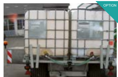
Double water tank