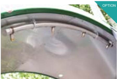
Water sprayer with nozzles. To achieve an optimal microorganism climate within the mound, the addition of water is essential.