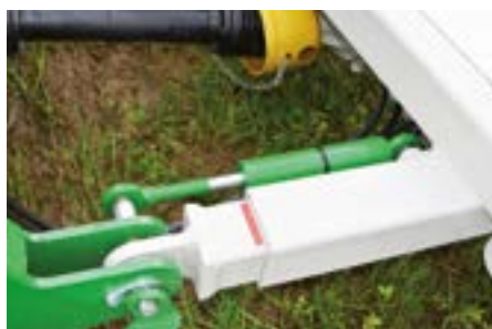
Hydraulic tilting system of the tunnel, so that the battery stays in the site where it belongs.