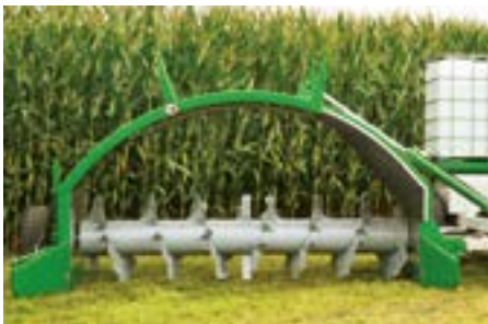
The solid arch construction made of 6 mm steel ensures a very high stability.