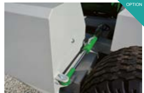
Hydraulically pivoting lateral weight