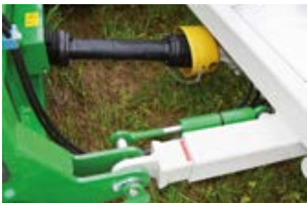
Direct drive – transmission on transfer shaft