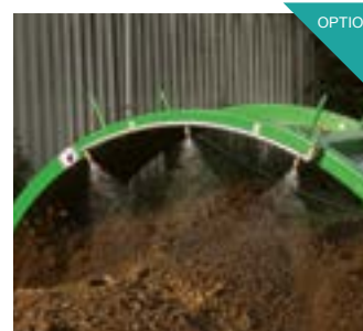
Water sprayer with nozzles. To achieve an optimal microorganism climate within the mound, the addition of water is essential.