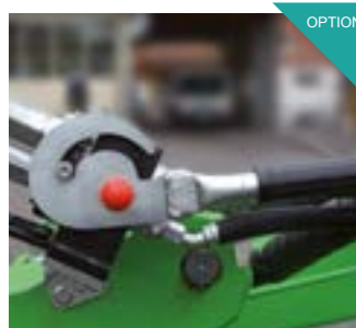
Hydraulic quick coupling for compact loaders