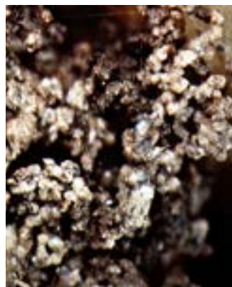
Perfect crumb structure - microscopic view

Within five to eight years you can increase the humus content in the soil from one to up to five percent.