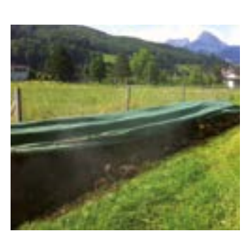
Maximum dimensions of the battery: 2.0 x 1.0 m