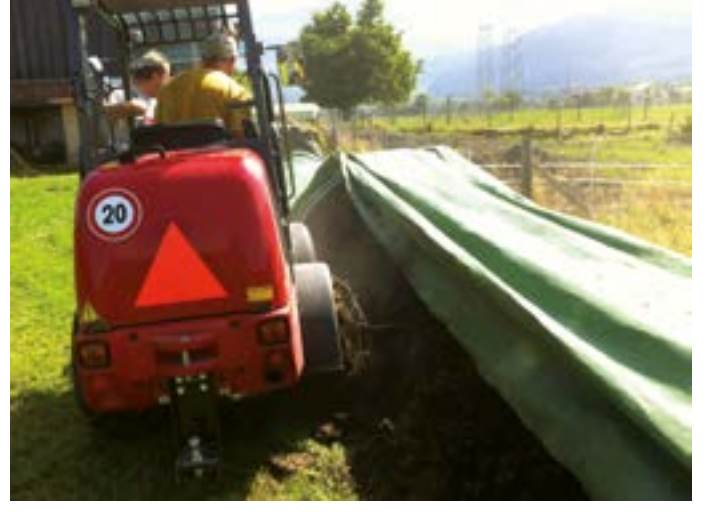
The fabric cover is joined to a smaller width to allow gases to escape. The hard manual work involving the wet fabric is avoided.