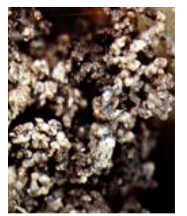
Perfect crumb structure - microscopic view

The temperature must not rise above 65°C and humidity must be between 50 and 60%. Additional information is available from the composting courses of Urs Hildebrandt: www.landmanagement.net.