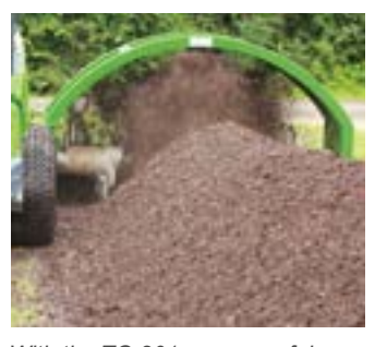
With the TG 201 a successful composting is achieved easily and quickly. This is due largely to the turning axis that works perfectly and that moves the material from the inside to the outside, so that the microorganisms can be replicated everywhere optimally.

Fast aerobic composting; within 8 - 12 weeks, depending on the material