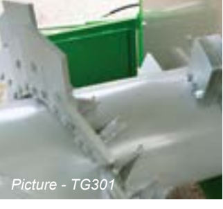
12 mm shaft width with 3 fixed screws. The balanced axle ensures long life.