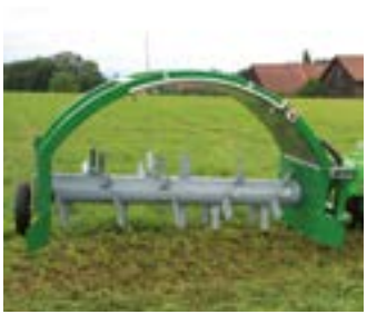
The solid arch construction made of 5 mm steel ensures a very high stability.